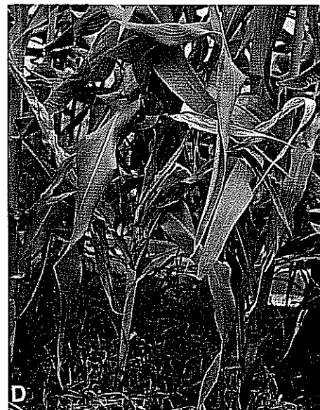
Figure 2.1. Examples of herbicide-resistant crops.