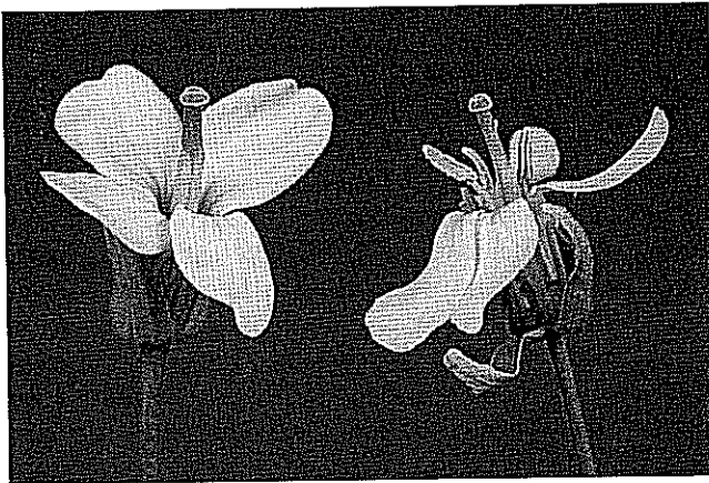
Figure 3.2. Use of a herbicide (glufosinate) resistance marker linked to a gene designed for dominant male sterility. Both resistant (left) and susceptible (right) oilseed rape plants were treated with glufosinate. The availability of linked herbicide resistance in this crop allows the maintenance and multiplication of the male sterile line after backcrossing with the parental line.

Research with herbicide-resistant plants has been important in demonstrating the molecular mechanism of herbicide action. The most unequivocal proof that a herbicide kills plants by affecting a single molecular site is to generate a resistant plant by manipulation of only the gene that codes for that site. The controversy regarding the mechanism of action of the aryloxyphenoxypropionate and the cyclohexanedione herbicides was resolved by generation of resistant plants by selection for resistant acetyl-CoA carboxylase (Parker et al., 1990). Previously, others had postulated another site of action (the plasmalemma) that might have had mammalian health implications. These examples of scientific spinoff from herbicide resistance research are but a few of many advances in plant science facilitated by or due entirely to research in this area. Thus, this type of research warrants continued public funding to enhance plant science in the United States. Research on herbicide resistance funded by foreign governments will undoubtedly continue.