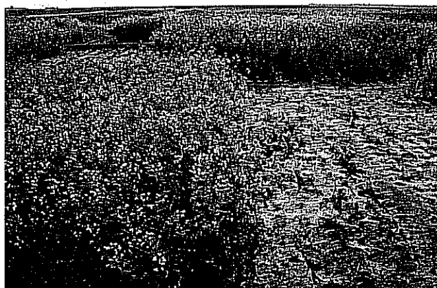
Figure 3.1. A field experiment in which sulfonylurea-resistant (left) and -susceptible (right) canola were treated postemergence with 10 g/ha of a "short residual" sulfonylurea herbicide. No phytotoxicity or yield effect of the herbicide was found, and excellent weed control was obtained. Introduction of this herbicide-resistant crop variety is not planned unless the potential of the resistant canola to become a "volunteer" weed in key rotation crops is minimized.

Introduction of a new species into an ecosystem has severely disrupted the ecosystem in some cases. There are few cases of which we are aware in which a new crop variety has escaped from an agroecosystem to disrupt surrounding natural ecosystems. In a few cases a crop has become a weed in other crops in agroecosystems. For instance, okra has become a weed in cotton in some subtropical areas of the United States (Egley and Elmore, 1987). Several forage crops (e.g., bermuda grass) are also weeds. One potential difficulty of herbicide-resistant crops would be their control when growing as a volunteer plant within a rotation crop. For example, corn made resistant to aryloxyphenoxypropionates or cyclohexanediones would eliminate the use of these herbicides in controlling volunteer corn in soybean fields. However, alternatives are available, such as rope wick application of glyphosate. Volunteer canola can also