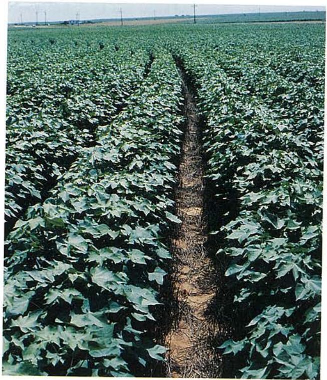
Figure 3.3. Cotton planted in a field containing wheat stubble in Terry County, Texas to conserve moisture and soil.

practices. The increased use of herbicides that may sometimes accompany conservation tillage or no-till practices may pose some risks to wildlife (Baker and Lafen, 1983). However, some weed control systems for no-till or lo-till have been developed which do not require more herbicide or higher costs for herbicides (Hartwig, 1990; Knake et al., 1990; Koethe et al., 1989).