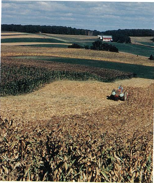
Figure 3.2. Plant residues are being left on a field in Carroll County, Maryland in the fall to help prevent soil erosion.