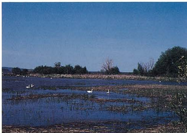
Figure 1.4. This scene is an example of a wetland complex in Wisconsin that includes deeper lake habitat as well as shallow wetland habitat. Areas such as this provide shelter and food for a variety of wildlife species including the Tundra swans ( Olor columbianus ) pictured here.

The U.S. Department of Agriculture (1987a) estimates that 118 million acres of cropland are subject to conservation compliance. Farmers are already applying basic conservation practices adequate to meet compliance standards on 35 million of these acres, while over 33.9 million of these acres subject to compliance have been entered in the CRP (Moulton and Dicks, 1987). Barbarika and Dicks (1988) anticipate that conservation compliance will promote increased use of conservation tillage, longer rotations including more forage and cover crops, and other basic practices that can be easily applied to all but 46 million acres with the greatest erosion potential.