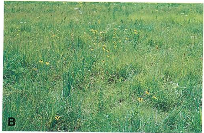
Figure 2.1. A one-acre prairie restoration plot was established at Pea Ridge National Military Park in Benton County, Arkansas in 1975.