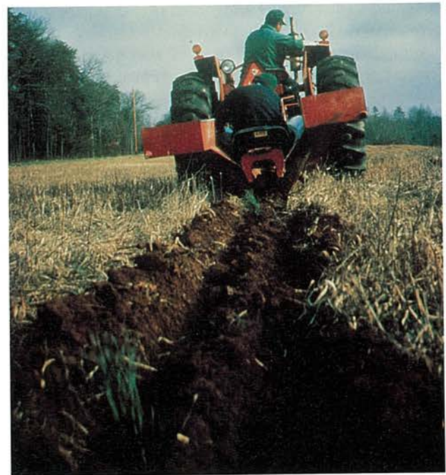
Figure 1.3. Tree planting machines used to plant tree seedlings, such as these Loblolly pine trees ( Pinus taeda L.), on most agricultural land.