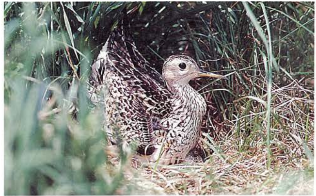
Figure 3.1. An Upland Sandpiper ( Bartramia longicauda ) returning to a nest containing four eggs in Ringgold County, Iowa. Upland Sandpipers prefer to nest in mid- to tall-grasslands that are undisturbed, such as CRP acres.

The long-term declines in these wildlife populations are caused by several related factors mentioned